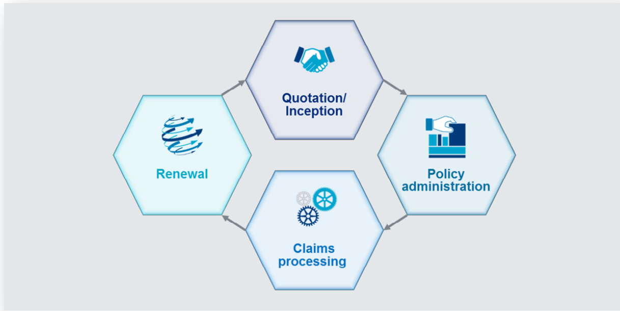
CHART 2: FLOWS OF PERSONAL DATA THROUGH THE INSURANCE LIFECYCLE